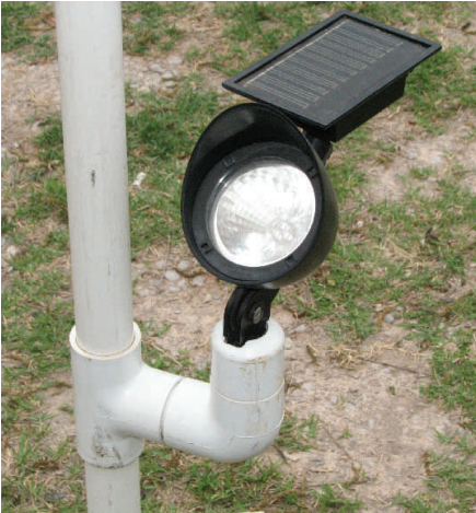
Figure 1 Complete Light Assembly

The parts of the light assembly must be custom fit for the light you have. My directions relate to the Malibu solar spotlight I have. Cut off a 2" piece of PVC pipe from the bottom of each 4' length of pipe. Cut the vertical piece of pipe 22" from one end so that you have both a 22" and 24" piece. Assemble the tee and one 2" piece and set aside for later.