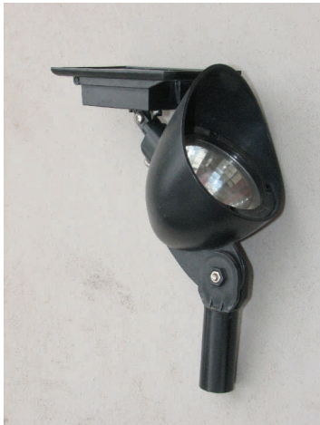
Figure 3 Malibu Spotlight

The Malibu light comes with both a spike to put it into the ground and a deck mount. The use of a Dremel Motor Tool makes shaping the deck mount and end cap very easy. I took the deck mount and ground its rectangular base into a circle so that it would fit inside the elbow. See Figure 2. I then used hot melt glue to secure it in place. This is the only time I used any glue. Be sure the mount faces straight up so the light will be vertical. After the glue has cooled, install the remaining 2" piece of pipe into the elbow. Tap it in place so it is secure. It may be easier to glue the mount in place after you finish shaping the end cap as described next.