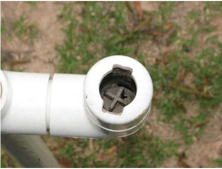
Figure 2 Spotlight deck mount inside elbow

The parts of the light assembly must be custom fit for the light you have. My directions relate to the Malibu solar spotlight I have. Cut off a 2" piece of PVC pipe from the bottom of each 4' length of pipe. Cut the vertical piece of pipe 22" from one end so that you have both a 22" and 24" piece. Assemble the tee and one 2" piece and set aside for later.