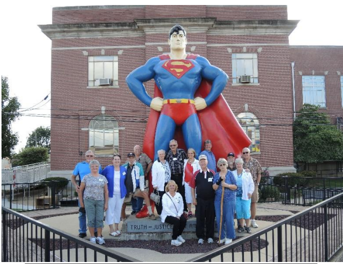
The group with Superman in Metropolis.