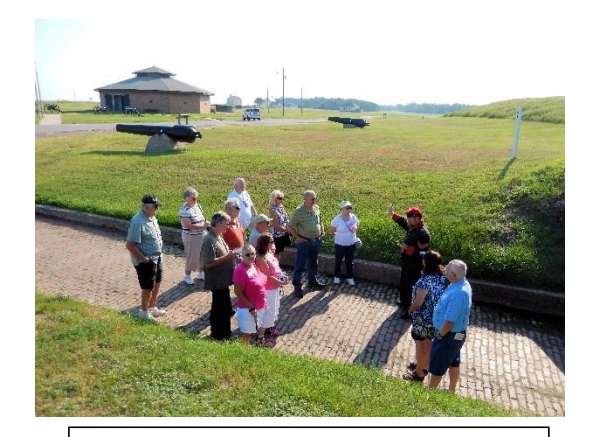
The group on tour of Ft. Morgan