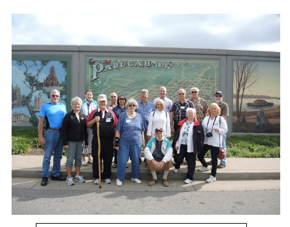
The group in front of the Paducah Wall – beautiful hand painted murals of Paducah's past.