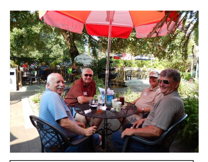
The guys relaxing while the women shop.