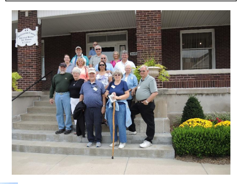
Above: The group in front of the Williamson County Museum.