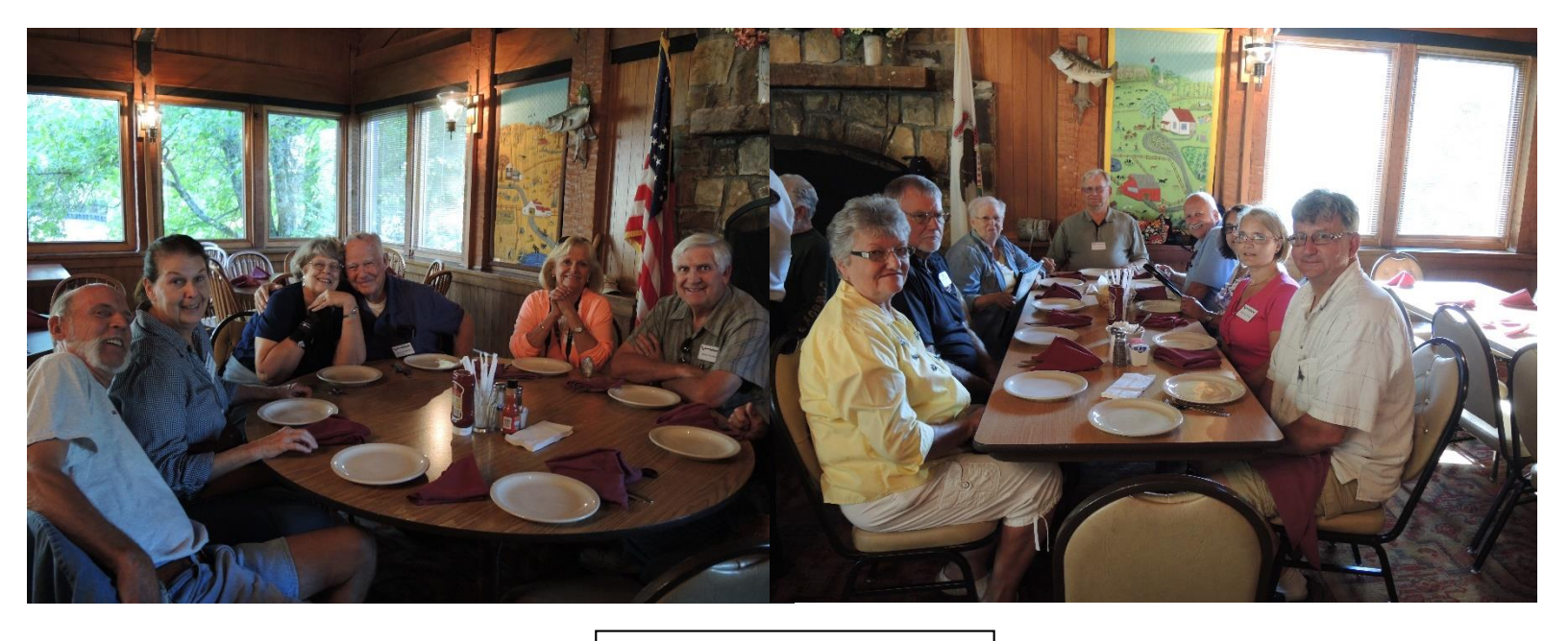
Lunch at Giant City Lodge