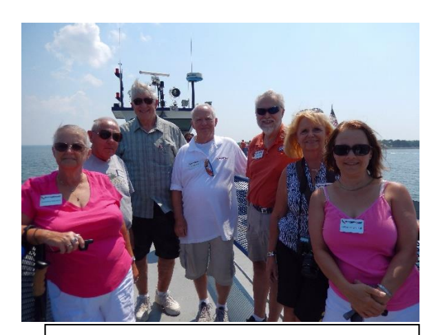
Enjoying a ride on the Mobile Bay Ferry.