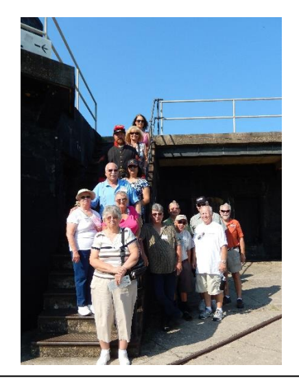
The group on tour of Ft. Morgan.