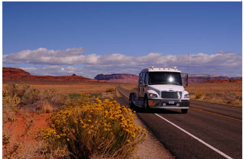
Our SportChassis in Canyonlands National Park

The 2009 meeting was a long one because there was a lot of business to cover. The review and finalization of our new By-Laws took the most time. Sue did a great job in keeping track of all that took place during the meeting. I’m sure you won’t have so much to read following the 2010 meeting.