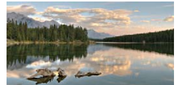
Banff National Park

Bottom line - there is something for everyone in Alberta.