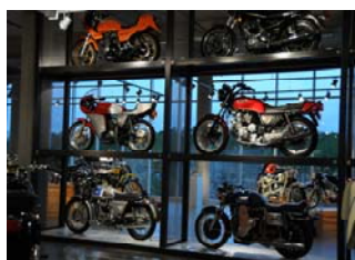
Some of the bikes in the Barber Motorcycle Museum in Birmingham, AL.