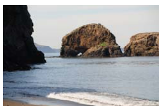
Above & Below: Coastline of Santa Cruz Island—Channel Islands National Park, CA.