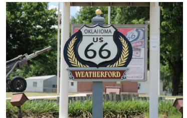
Touring Weatherford and a Wind Turbine Farm