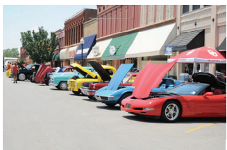
Route 66 Days in Clinton